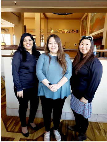
Aleutian Pribilof Islands Association, Inc and Unified Solutions

Unified had a wonderful time meeting, collaborating, and providing Training and Technical Assistance to so many of our wonderful Grantees in sunny Tucson in late January 2020. To all of our Grantees, it is always a pleasure to see you in person. We are honored to serve you!