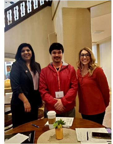
Akiak Native Community and Unified Solutions