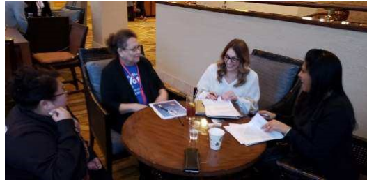
Ft. Peck Assiniboine & Sioux Tribes and Unified Solutions