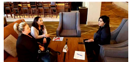
Kalispel Indian Tribe and Unified Solutions