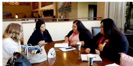
Quechan Indian Tribe and Unified Solutions