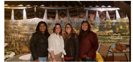
Wampanoag Tribe of Gay Head And Unified Solutions