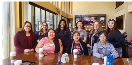
Emmonak Women's Shelter and Unified Solutions