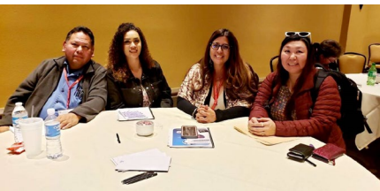
Pascua Yaqui Tribe and Unified Solutions