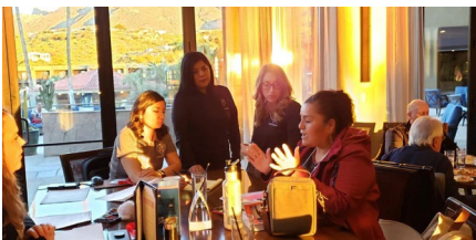
Fort McDowell Yavapai Nation and Unified Solutions